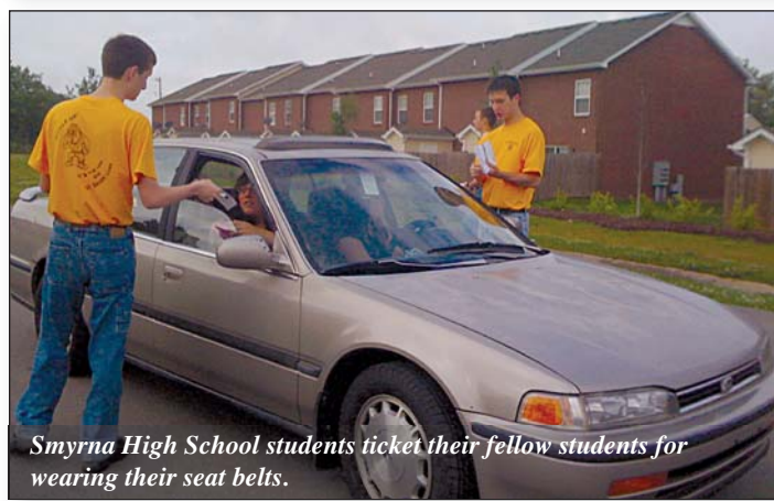
Smyrna High School students ticket their fellow students for wearing their seat belts.