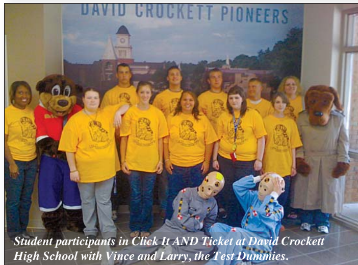
Student participants in Click It AND Ticket at David Crockett High School with Vince and Larry, the Test Dummies.