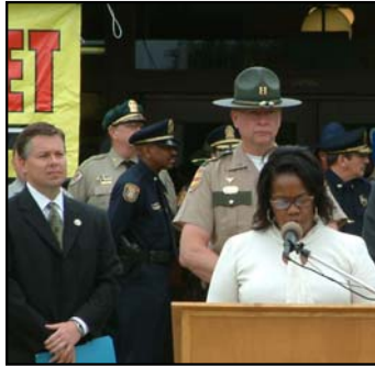
Officials announce the Hands Across the Border event at the Memphis press conference.