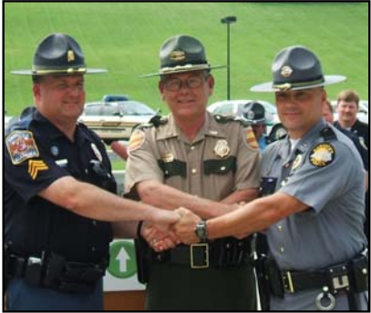
Troopers at a Hands Across the Border event.

The proportion of unbuckled deaths at night is considerably higher than the nearly as alarming 44 percent of passenger vehicle occupants who were not wearing their seats belts and were killed during daytime hours across the nation that same year.